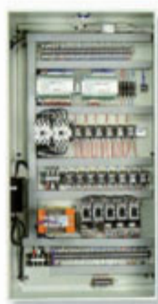
電控箱裝置 Electrical Cabinet