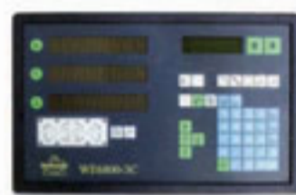
數字尺顯示器 Digital Read Out