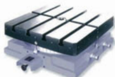
分度工作台 Index Table