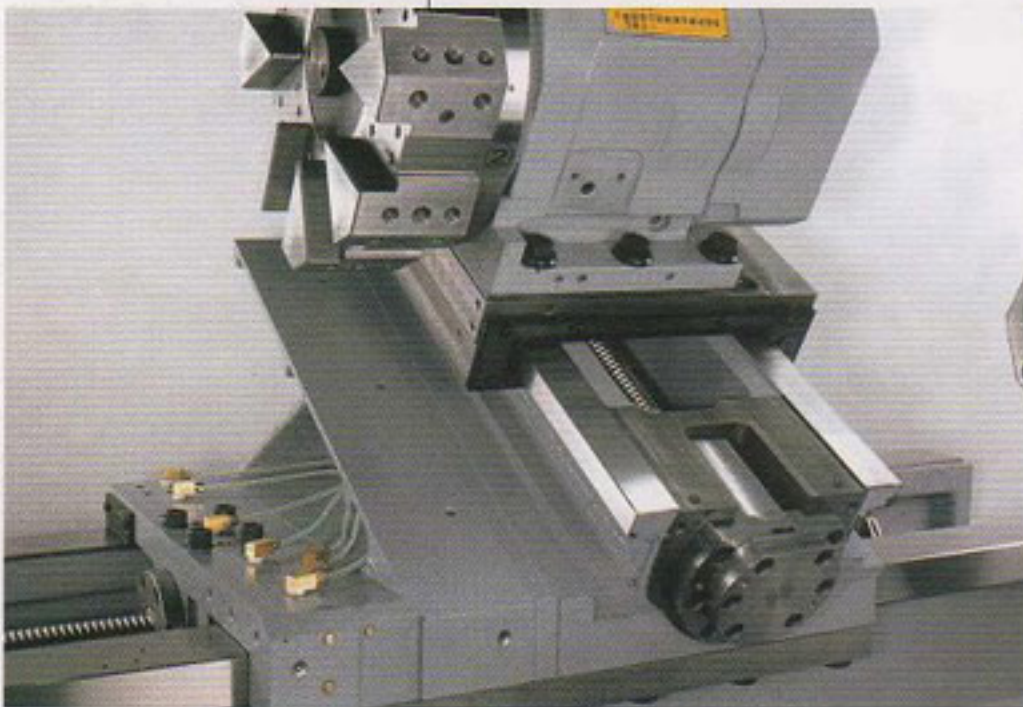
High performance X and Z axis box slideways