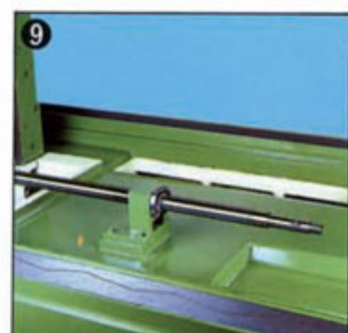
• A precision cross feed ball-screw.