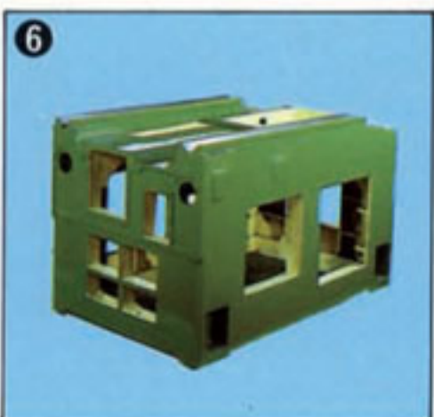
• Enlarged double vee and extra-long slide way of base