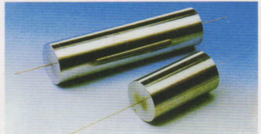
■ Depth: diameter=200 : 1